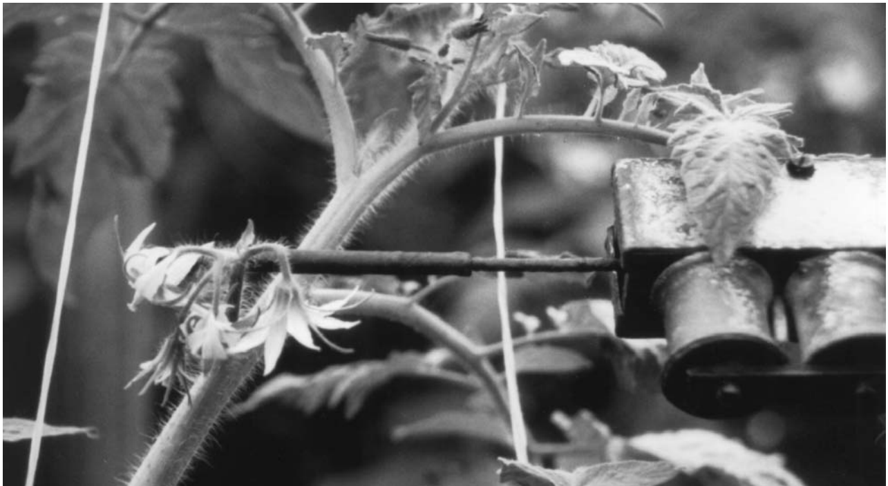
Touch the pollinator wand to the upper side of each pedicel (flower stem). Do not touch individual flowers.

In a hobby greenhouse, the expense of a pollinator is probably not necessary. You can purchase an electric polli-