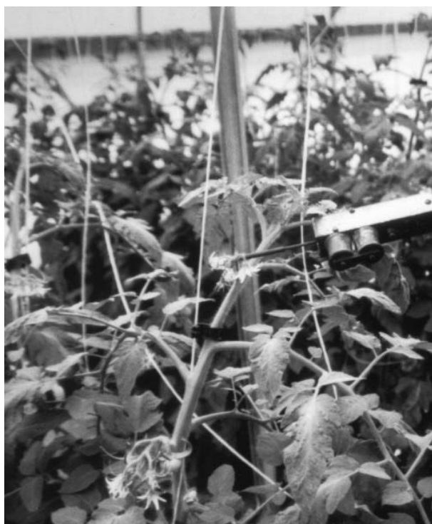
Pollination is best accomplished with an electric pollinator.

As you prune the plant to one main stem, wrap it around the support string. You can prune and wrap in one operation, doing both to a plant before moving on to the next plant. Always wrap in the same direction—if you start