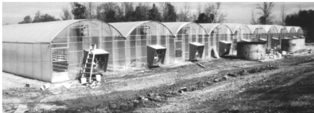
Shown are 10 greenhouse bays in a gutter-connected range (1/2 acre).

To determine how much acid to add to a bulk or concentrate tank of nutrient solution, take 1 gallon of solution and add 1 ml of acid at a time until the pH of the nutrient solution is within the range stated. Then, multiply the amount added to 1 gallon times the number of gallons in the tank. If