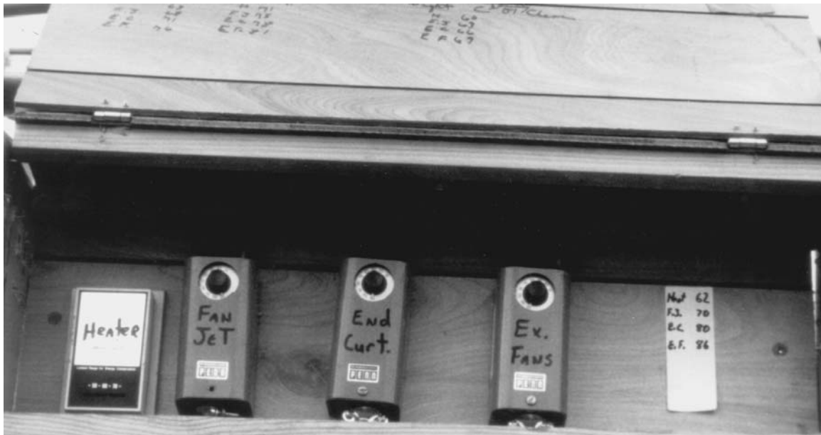
Locating thermostats in a box will avoid direct sun on them. An aspirated box is best.