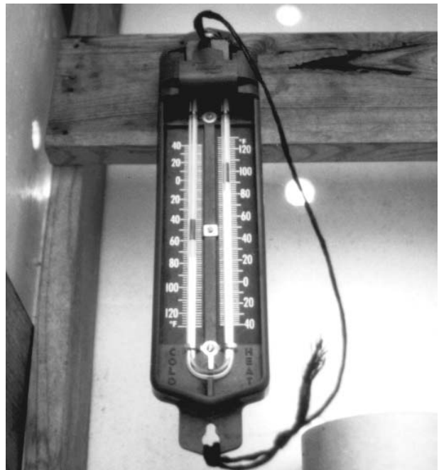
Use a thermometer that records the high and low temperatures.

The most common product is Kool-Ray, from Continental Products Co. This material is diluted with water; use 2 to 20 parts water for 1 part Kool-Ray, depending on the amount of shading desired. It is better to apply a thin coat early in the season (using more water) and then darken it later if needed. It is much easier to darken the shade than to lighten it once it has been applied. The ratio of 1 part Kool-Ray to 7 or 8 parts water has worked well in Mississippi. About 10 gallons of dilute solution covers a standard greenhouse (24 by 96 feet). It is best to apply it as small droplets and try to avoid streaking. Apply it during