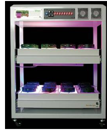
Fig. 2. Tissue culture cart developed (Left: Giant E-Light, 8 layers, 40 vessels per layer, L107-W62-H195 in cm, power consumption: 110VAC/12A or 220VAC/5.5A; Right: Mini E-Light, 2 layers, 12 vessels per layer, L66-W40-H80 in cm, power consumption: 110 VAC/0.61A or 220VAC/0.3A).