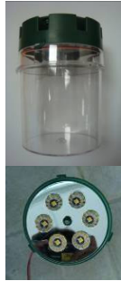
Fig. 1. Tissue culture vessel with 2 lids (top), outer lid flip over shows 6 lamps per lid (bottom)