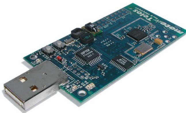
Fig. 1. Telos ultra-low power wireless module (“mote”) with IEEE 802.15.4 wireless transceiver.

Mica [5], released in 2001, was carefully designed to serve as a general purpose platform for WSN research. Compared with preceding designs, it offered more memory (4kB of RAM and 128kB of flash), extensive sensor interfaces (8 analog lines, several digital IO